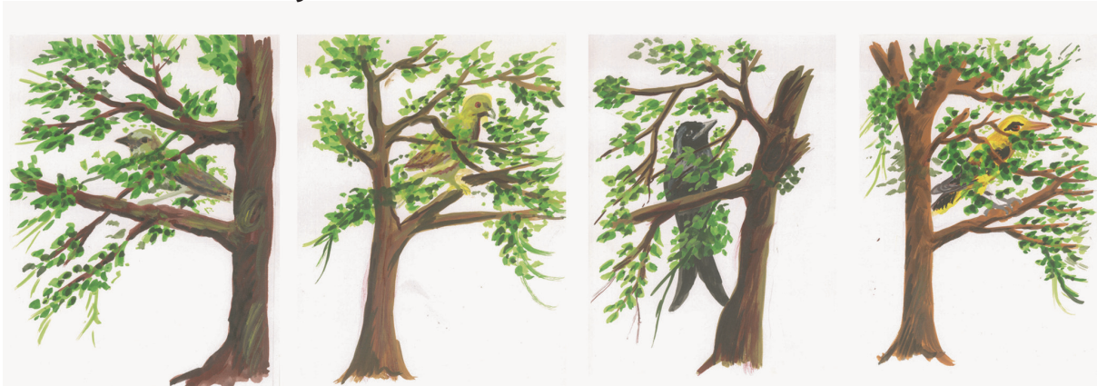
(Yellow footed green pigeon, Golden oriole, Yellow throated sparrow, Black Drongo)